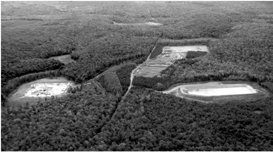
Fortuna Energy site (tract 587) in Tioga State Forest, PA, illustrating degree of forest fragmentation of a single HVHFF installation.

be unavoidable. In particular, the most significant potential wildlife impact associated with high-volume hydraulic fracturing is fragmentation of rare interior forest and grassland habitats... " and "Human induced openings can influence breeding bird productivity several hundred feet from the edge of the forest through increased predation and increased nest parasitism."