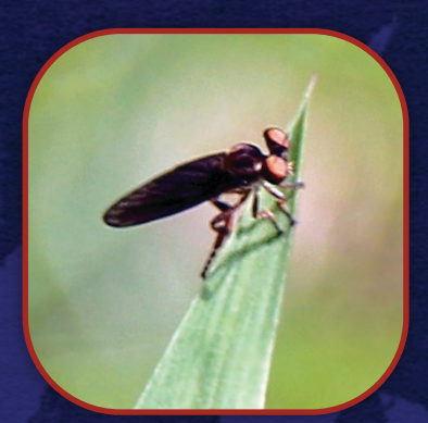
Gnat ogre is a flower-visiting fly