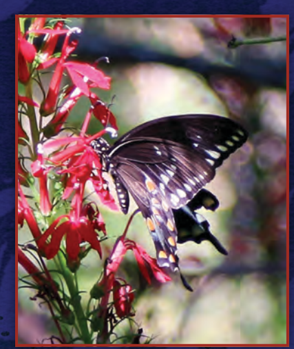
Spicebush swallowtail on cardinal flower

Donations to Hudsonia are deductible to the fullest extent allowed by law. Hudsonia's most recent Form 990 is available from the New York State Department of Law Charities Bureau or the Hudsonia office.