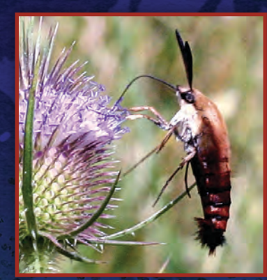
Hummingbird moth on common teasel