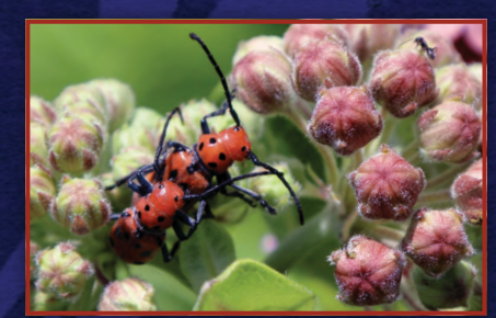
Milkweed beetles mating on common milkweed