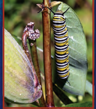
Monarch caterpillar on milkweed

This unfolding crisis has in turn brought attention to the importance of pollinator-friendly plants. Some insect pollinators, as either