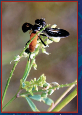
Feather-legged fly on sweet-clover

adults or larvae, can feed only on certain plants, in some cases just a few or a single species.