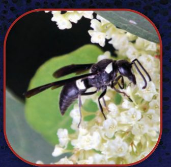
Four-toothed mason wasp on knotweed