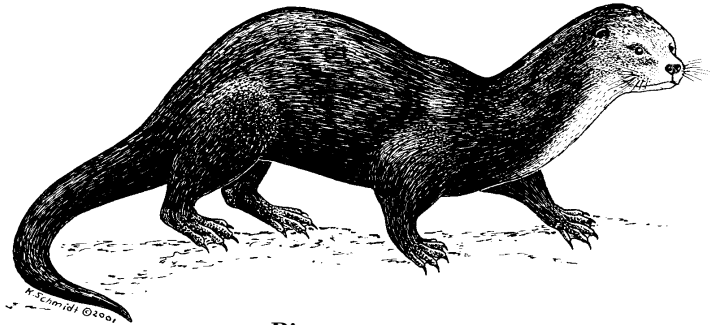
River otter.

Mechanical disturbance or changes in surface water levels or chemistry could disrupt the floating vegetation mats. Recreational uses such as boating, fishing, or hiking can be sources of garbage, pollutants, and disturbance. Maintaining a broad forested buffer around the lake is critical for preserving habitat quality.