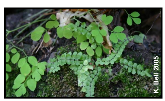
Maidenhair spleenwort and Allegheny-vine

Marble knoll is an uncommon habitat type that is restricted in Dutchess County to the Harlem Valley region. It occurs primarily where Stockbridge Marble bedrock forms low knolls or ridges, usually with extensive marble outcrops and sandy or gravelly soils, which help to create a warm and dry microclimate. Marble knolls were commonly used for pasture within the last few decades, and many now support red cedar woodlands with small meadow-like openings. Those with at least a partly open canopy can be important sites for rare plant species.