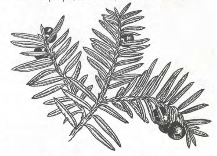
American yew (Taxus canadensis)

Massachusetts, and Mexico, and then participating in studies of reptile and amphibian populations at the Museum's former field station on Long Island. Natural history was more than just making a list of species for an area. According to the de facto definition used by the American Museum and many other natural history museums, natural history included detailed field study of flora, fauna, geology, and people, as well as collection, identification, preservation, and laboratory study of specimens, and classification of organisms (and, of course, publication of the results). Approaches ranged from observations of particular species by habitat, place, and date, to detailed mark-andrecapture study of animal populations in relation to patterns in their environment. Both field biologists and anthropologists, to some extent, examined interactions between people, other biota, and environment.