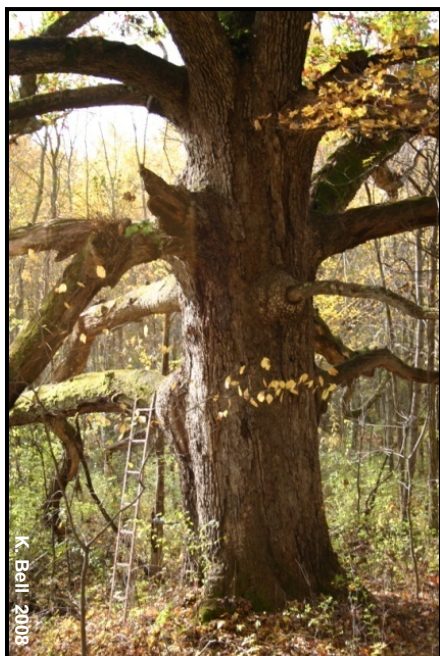
K. Bell 2008