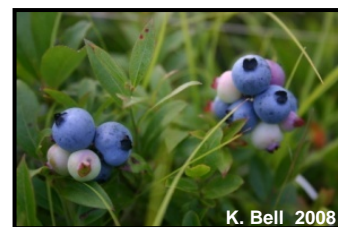
K. Bell 2008