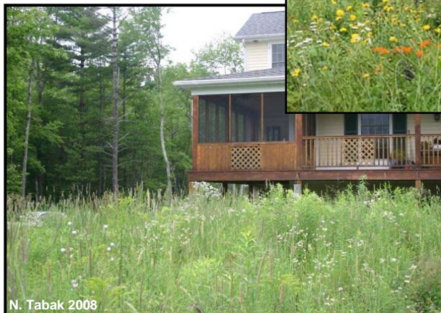
N. Tabak 2008